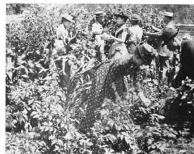
Miller Family in their

Enhanced black and white photo of the Miller Family Garden. 2 1/2 x 6" newsprint photo included. Title: "In the garden at Manhattan, later Normandy Park" 7 people working in a vegetable garden.