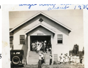
Angle Lake Church

Black and white photograph of the Angle Lake Presbyterian Church in 1936. A group of people are standing on the church steps while another group of people is visible around the corner, standing just outside the foyer. An old model car is parked beside the church steps. The Angle Lake Church was located on South 192nd Street, East of Des Moines Way.