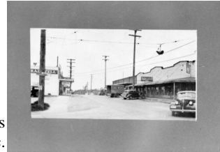
Photo b.) has above quote from Angelo Balzarini handwritten in ink on back.

Photo a.) gray toned B & W photo showing the main business district of Burien at Ambaum and SW 152nd looking west. Note inside reads: BURIEN BUSINESS DISTRICT -- in this 1940 photo of SW 152nd, looking west from Ambaum Road, the camera catches a look at the Burien business district. The Tradewell Store on the left once housed Burien's first movie theatre. "They used to set up wooden chairs for us to sit on," remembers Angelo Balzarini, long-time Burien resident. This neighborhood is now "Olde Burien" and is considered historic.