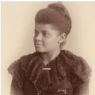
8. Ida B Wells

H. "The battles that count aren't the ones for gold medals. The struggles within yourself – the invisible, inevitable battles inside all of us – that's where it's at."