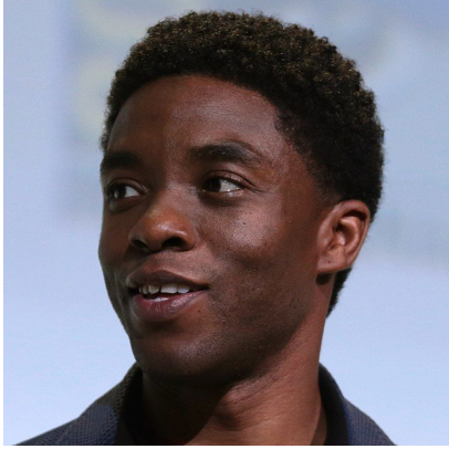
10. Chadwick Boseman

J. Where justice is denied, where poverty is enforced, where ignorance prevails, and where any one class is made to feel that society is an organized conspiracy to oppress, rob and degrade them, neither persons nor property will be safe.