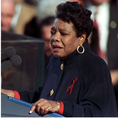
7. Maya Angelou

G. "I'm not concerned with your liking or disliking me... all I ask is that you respect me as a human being."