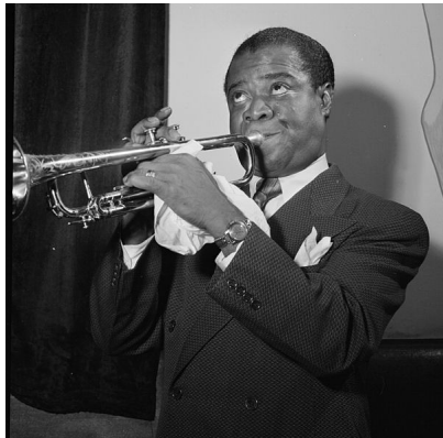
6. Louis Armstrong

F. "I splashed onto the TV screen at a propitious historical moment. Black people were marching all over the South. Dr. King was leading people to freedom, and here I was, in the 23rd century, fourth in command of the Enterprise."