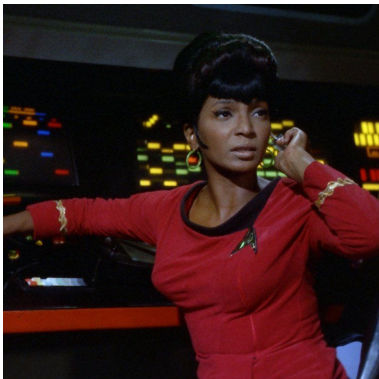
3. Nichelle Nichols