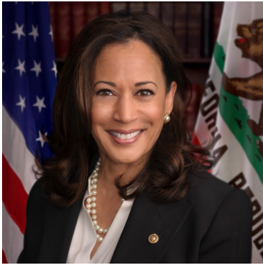
1. Kamala Harris

Match the portrait to the persons famous quote!