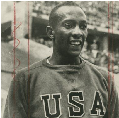
9. Jesse Owens

I. "The projects that I end up doing, that I want to be involved with in any way, have always been projects that will be impactful, for the most part, to my people - to black people."