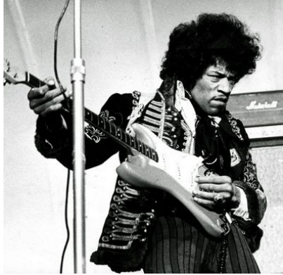
4. Jimi Hendrix

D. "You may write me down in history With your bitter, twisted lies, You may trod me in the very dirt But still, like dust, I'll rise."